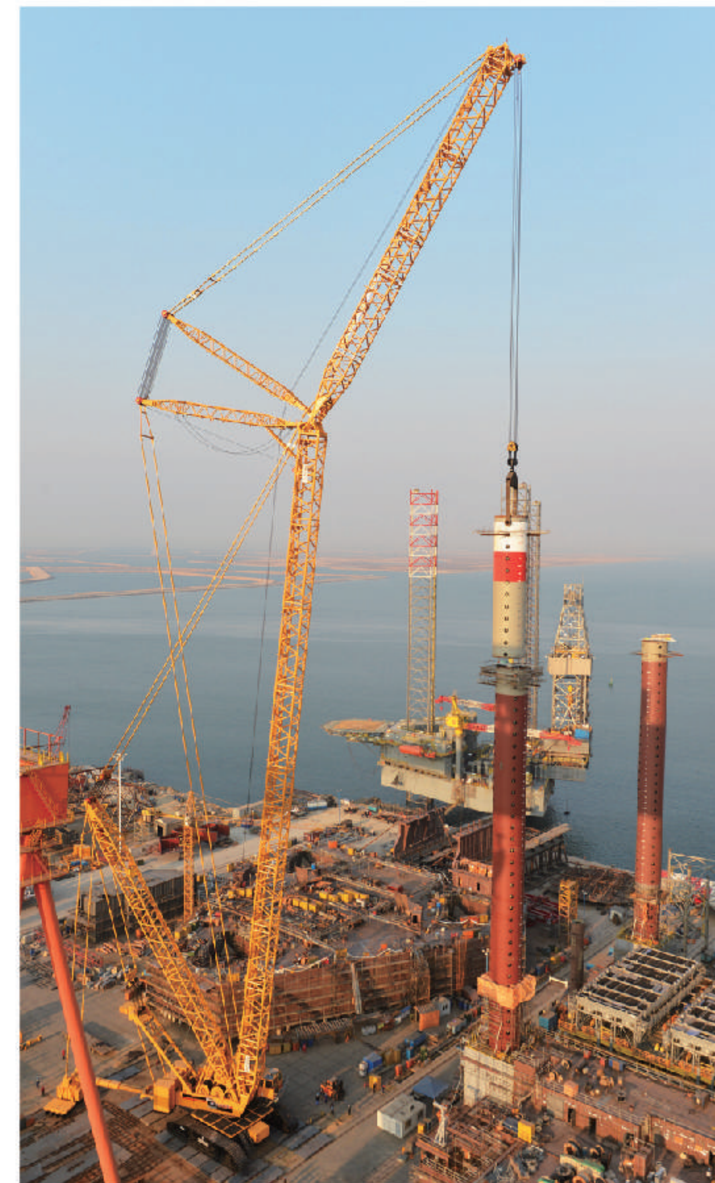
■ XGC28000助力海洋工程 实现海工吊装工艺革新