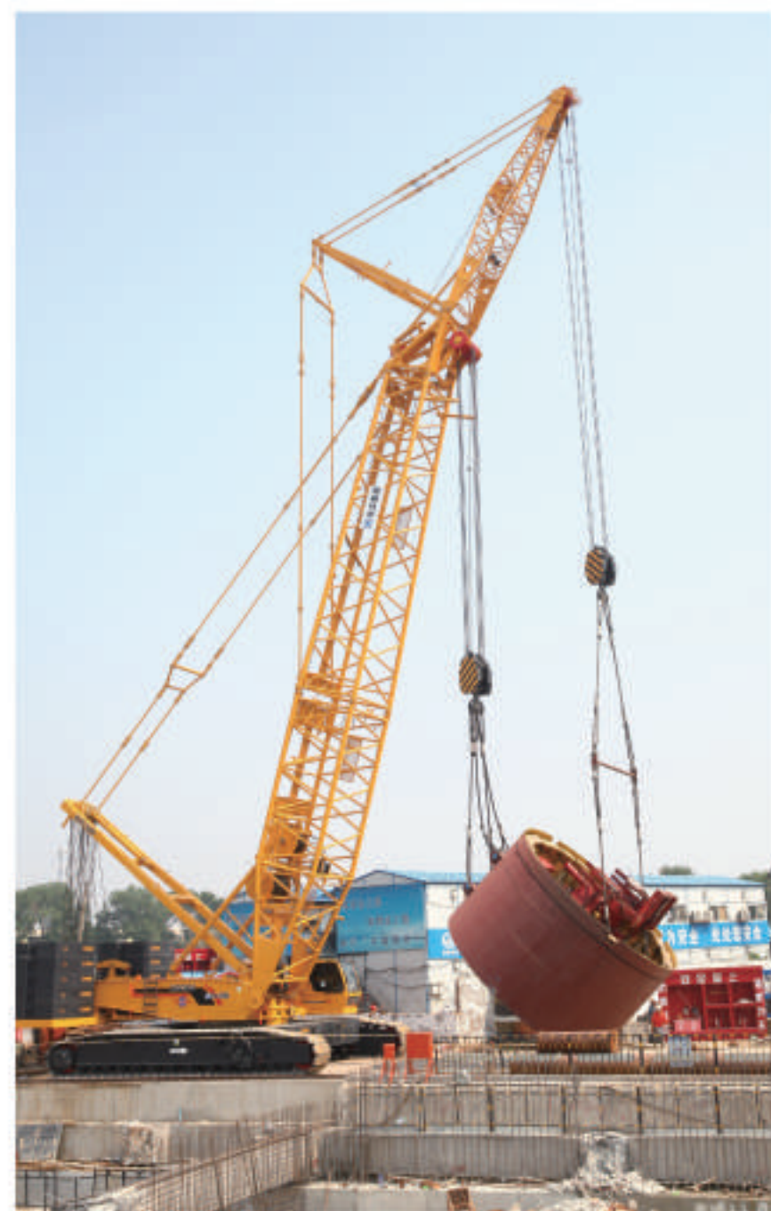
■ XGC260参与天津地铁6号线建设