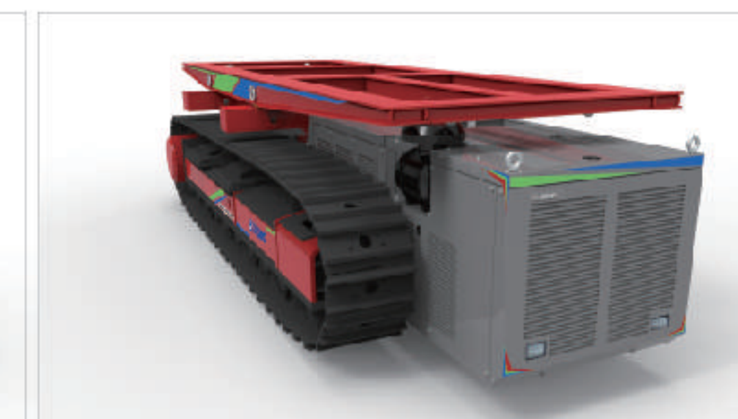
XGT200牵引机 (crawler type drawing tractor and transporter) XGT200运输车 (crawler type drawing tractor and transporter)