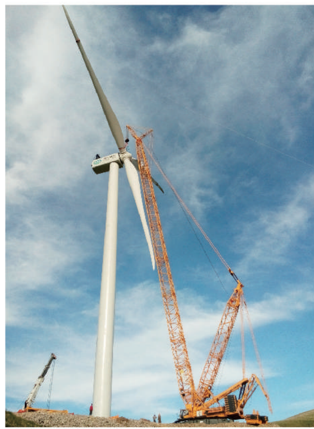
■ XGC650 3MW风电吊装