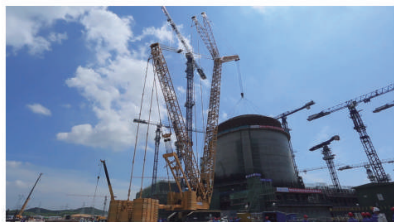
■ XGC28000防城港“华龙一号”穹顶吊装